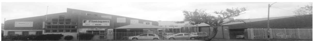
*(Pictured in 2014 before the relaunch of our new facility)

Sometimes through no fault of your own, your vehicle may encounter a few knocks and dents. To help you as a client we make sure that your vehicle is returned to you in its pre-damaged condition, Flanagan's Auto Body Repair adheres to specific procedures which ensure that each repair meets our stringent standards. We believe in relationships and good communication platforms.